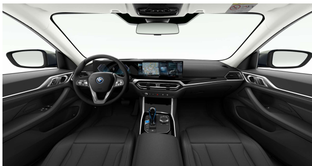
Sensatec perforated | Black (KHSW)