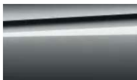
Skyscraper Grey metallic (C4W)