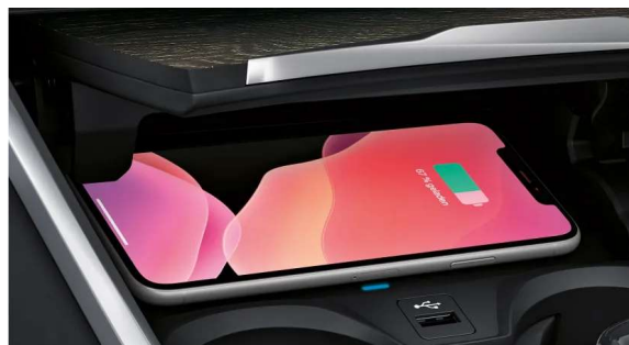
Wireless charging tray