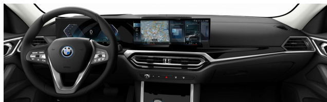
Interior trim finishers Black high-gloss (4AT)