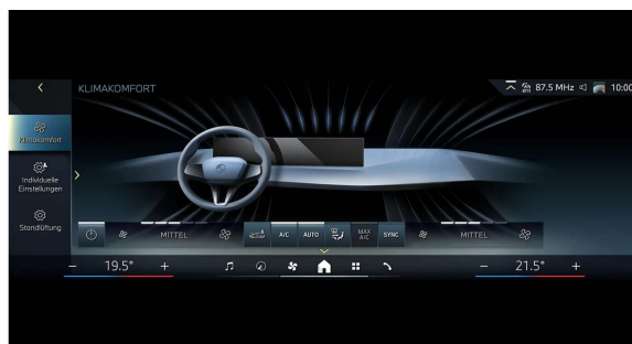
Automatic air conditioning, 3-zone control