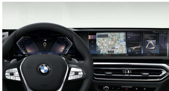
BMW Live Cockpit Plus