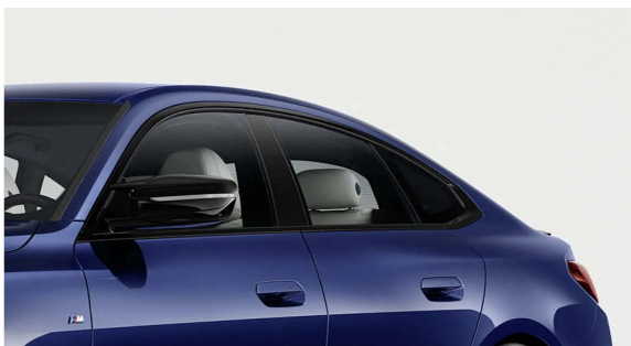
M high-gloss Shadowline