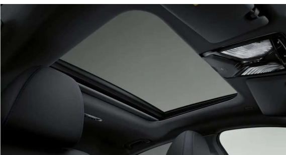
Glass roof, electrical