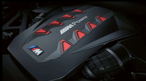
4,395cc M TwinPower Turbocharged V8 petrol engine