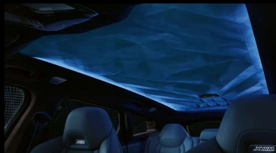
Sculptural Alcantara headliner with prismatic 3D structure and ambient lighting.