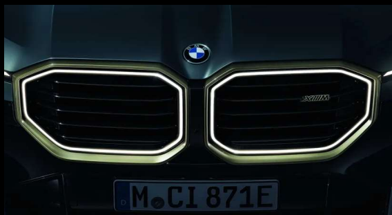
BMW kidney 'Iconic Glow'