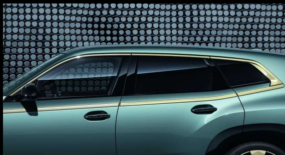
M high-gloss Shadowline, window recess finisher strip in Night Gold