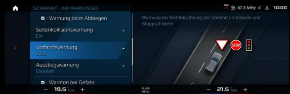
Driving Assistant Professional