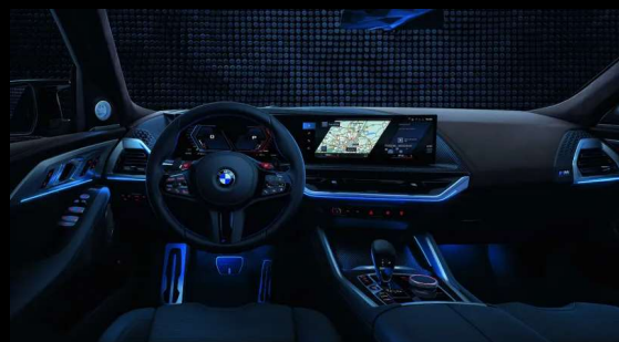
BMW Live Cockpit Professional