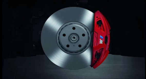
M Sport brake, red high-gloss